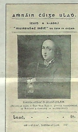
Amhráin Chúige Uladh - Cuid a hAon (Ó Muireadhaigh 1927). R2209304