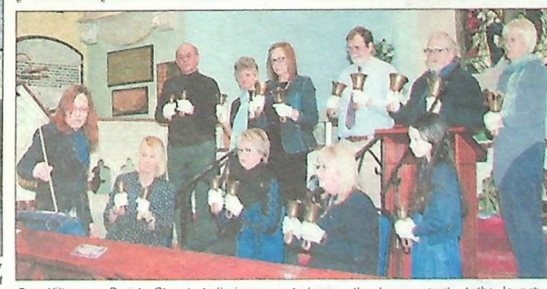
The Kilbroney Parish Church bell ringers entertaining the large crowd at the launch of 'Celebrating 200 Years of Saint Bronach's, Kilbroney Parish Church, Rostrevor'. R2209245