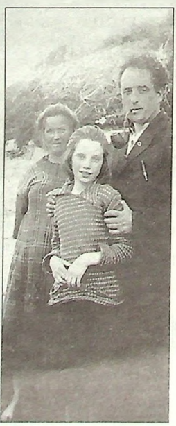
Cuid den stoc nua a fuarthas ar na mallabha. R2209306